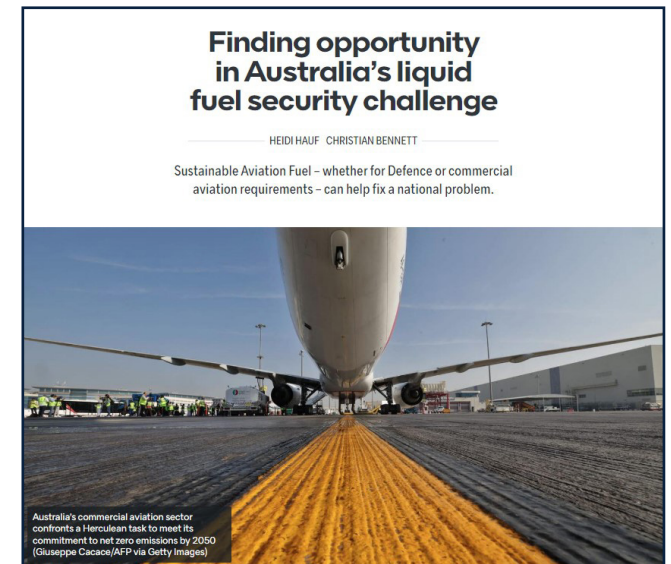
Excerpt of the co-authored article published by the Lowy Institute's Interpreter blog.